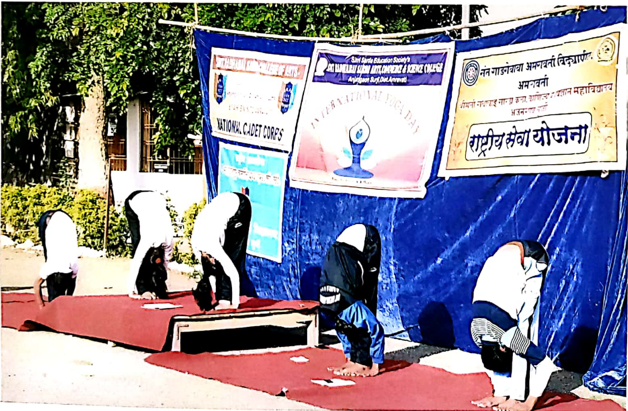
Students and staff are performing Yogic asanas at International Yoga Day. (2018 -19)