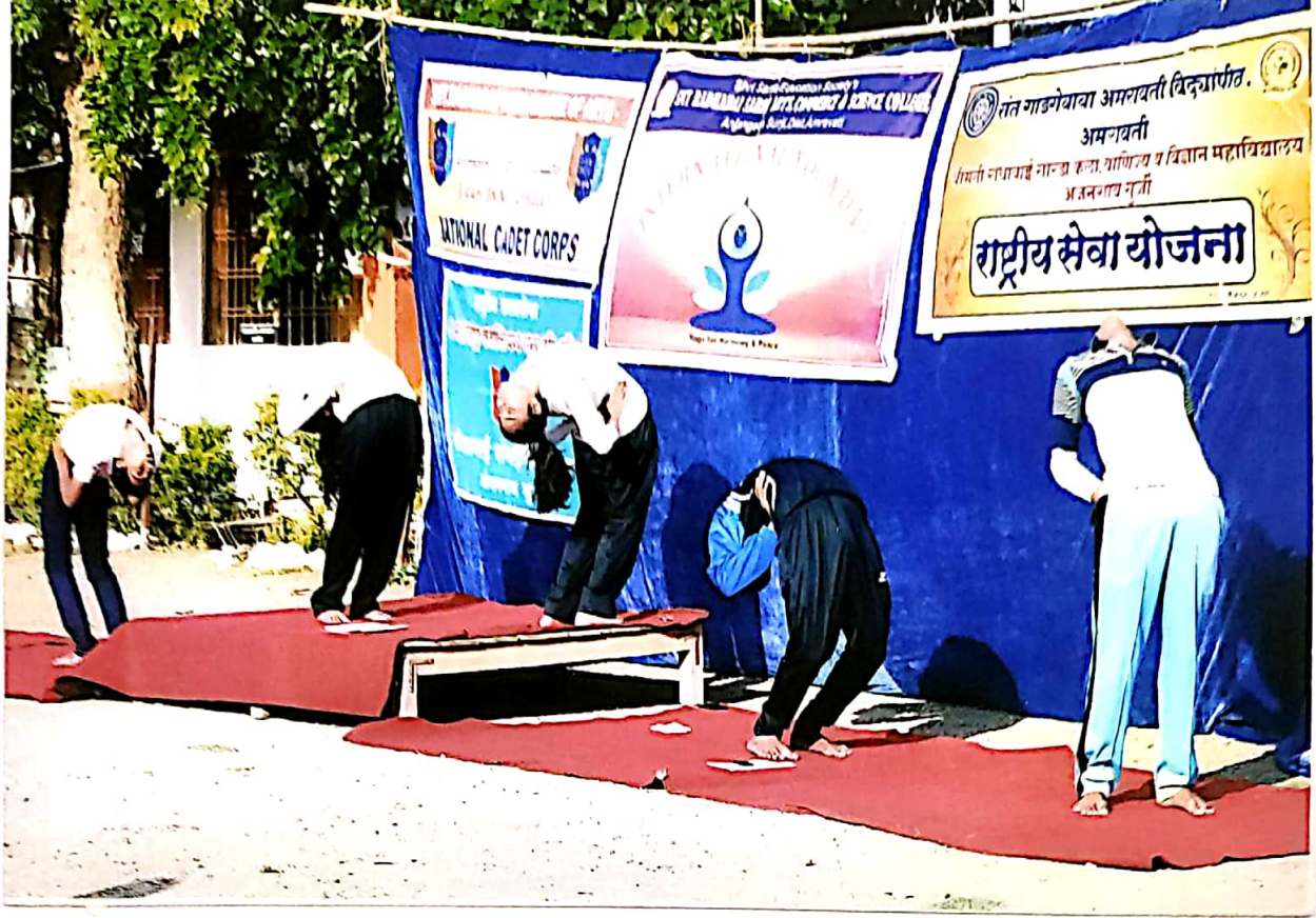
Student are performing Yoga on International Yoga Day. (2018 -19)