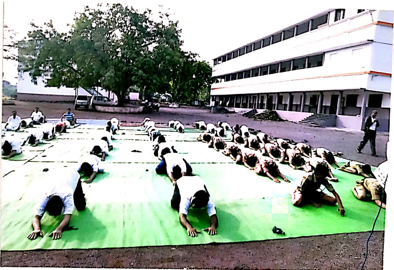
Student are performing Yoga on International Yoga Day. (2018 -19)